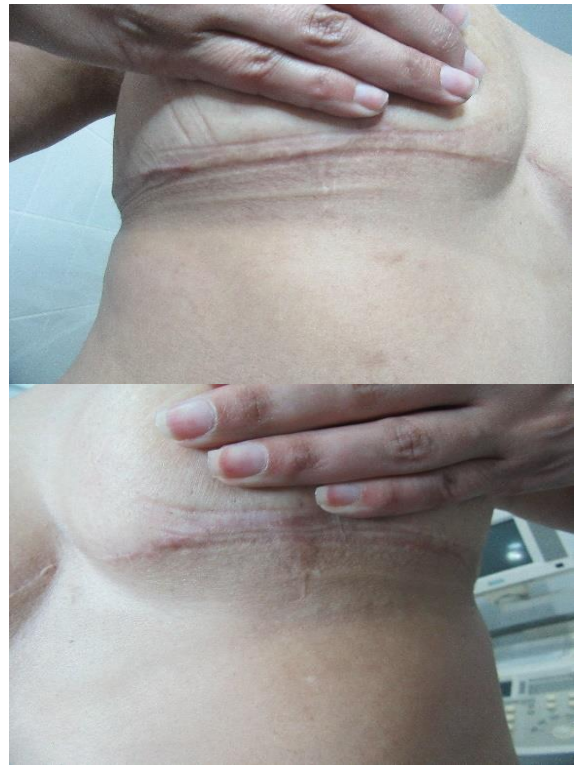
Figure (1): a transverse scar in the lower breast fold of the mammoplasty surgery on both sides.

Six months after the surgery, the patient raised a claim against the surgeon, and she was examined by the forensic team. Both breasts were similar, no masses were felt, and total removal of the nipple and areola was observed. A completely healed midline longitudinal scar, 15 and 13.5cm in length were observed on the right and left breasts respectively. A completely healed transverse scar, 24 and 22cm in length were seen on the underside of the right and left breasts, respectively.