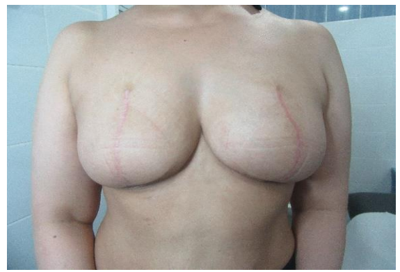
Figure (2): a longitudinal scar on the midline of both breasts.

The surgeon, who was a Serbian consultant expert in plastic surgery visiting Kuwait, admitted that the report of the first reduction operation had not been viewed before surgery. He mentioned that the inferior pedicle technique might have been used in the 1st reduction. Consequently, the superomedial pedicle technique used in the second reduction led to the cutoff of the NAC blood supply. He reported that the patient could not access the reports of the previous reduction before operation and