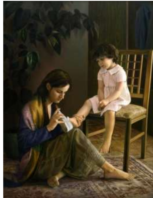
Figure No. (5,6) the artist Iman al-Maliki - oil on Toulal - the girl and the teacher