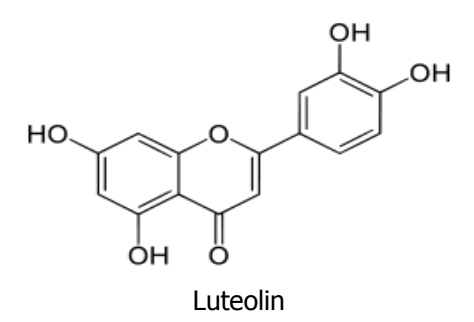
Figure 1. Structure of the banana peel crude alkaline extracted compound

The main objective of the present study was to characterize the pigment compound Luteolin, which exists in the banana peel crude alkaline extract. The structure of this compound is shown in Figure 1.