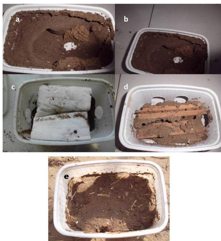
Plate (2): Corrugated cardboard bait material, b-Cellulose bait material, c-Toilet paper bait material d-Wooden stakes bait material and e-Wooden particles material

Soil translocation by A. ochrachus as in plate (2):