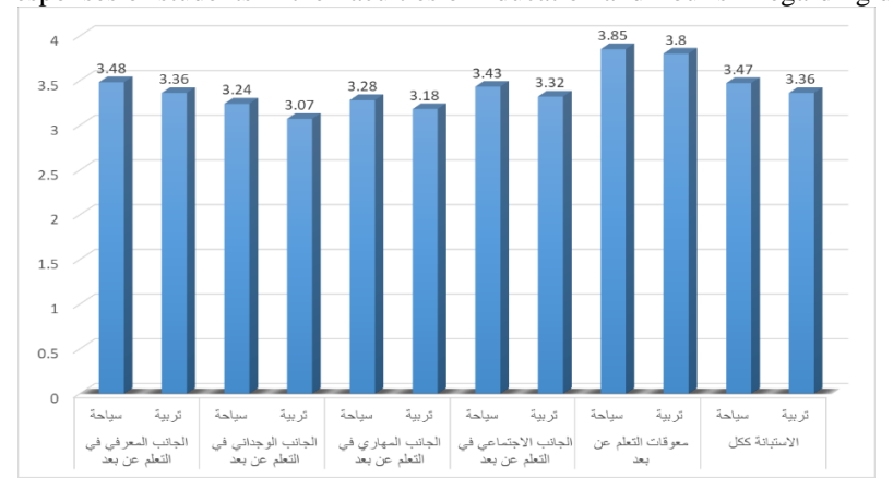
Figure 3 Difference between the responses of students in the Faculties of Education and Tourism regarding distance education

The previous findings give proof of the invalidity of the second hypothesis that "There are no statistically significant differences between the attitudes of students of the faculties of (Education, Tourism and Hotels) at Fayoum University towards the experience of Distance learning in light of the Corona pandemic, according to their learning outcomes"