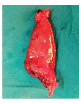
Figure (4): After Excision.

blood sugar, prothrombin time & activity and hepatitis B & C markers. Abdominal Ultrasound examination was done. Upper GIT endoscopy was done for determination of the site of varices, classification according to Sarin and sclerotherapy was done when needed.