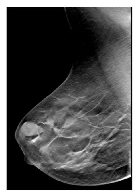
Figure (1): 3b Tomosyntheis MLO.

tomosynthesis showed a smoothly circumscribed mass of equal density with no associated distortion or calcifications which indicated its benign nature (Figures1 & 2).