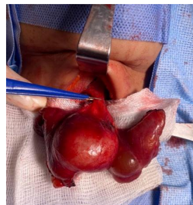
c) Pyramidal lobe