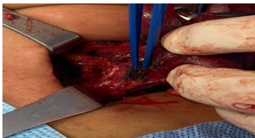
Fig 3: Taking down Berry,s ligament