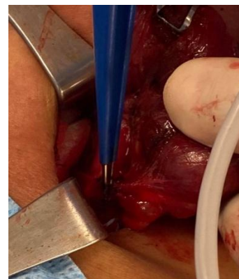
b) Inferior pole