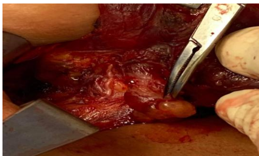
Fig 2: Identification of recurrent laryngeal nerve.