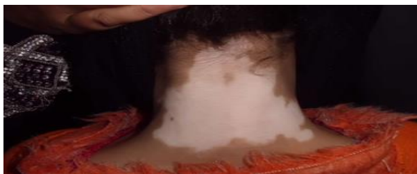
Fig. 3: a patient with localized vitiligo