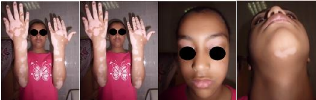
Fig. 1: a patient with generalized vitiligo