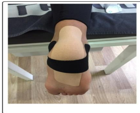
Fig. (5) Kinesio taping treatment applied to the Achilles tendon and heel region. [13].

Arch taping as described by Hunt et al. (82) was used in this case series. Multi-purpose polyethylene coated cloth tape (47 mm, Tyco, Norwood, MA) with natural rubber based adhesive was applied with the patient seated and the involved side's ankle resting on the uninvolved knee. The ankle was maintained in 0° dorsiflexion during tape application. This taping technique places the main supporting strap across the posterior calcaneus and then in line with the bands of the plantar fascia to anchor just distal to the first through fifth metatarsal heads.