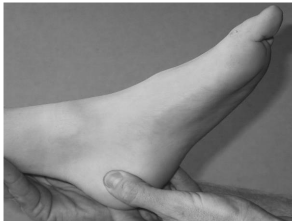
Fig. (3) The squeeze test. Medio-lateral compression of the calcaneal growth plate to elicit pain in Sever's disease [11]

When a pediatric patient presents with intense heel pain, plain radiographs of the foot are usually obtained as part of the clinical evaluation in emergency medicine because it has minimal radiation exposure. Radiographic evidence of Sever's injury had been reported to include 2 findings: increased density and fragmentation of the calcaneal apophysis see Figure (4). [12]