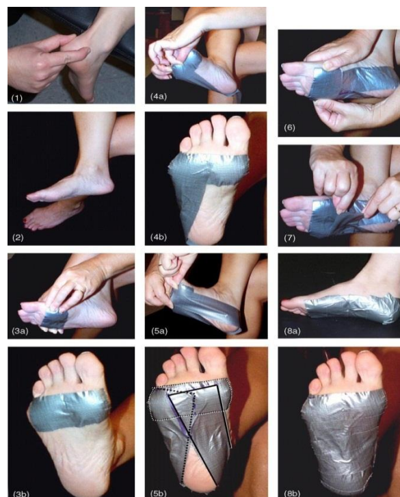
Fig. (6) Pain produced with calcaneal Squeeze test. 2 Place involved foot on opposite knee. Hold ankle in about 0°. 3 (a and b) Apply tape strip that will cover metatarsal heads. 4 (a and b) Apply long tape-strip to wrap around back of calcaneus and onto lateral plantar foot from approximately the 5th to 3rd metatarsal heads. 5 (a and b) Attach the medial portion of the long tape-strip to approximately the 1st to 3rd metatarsal heads. 6 Apply short tape strip that will cover the metatarsal heads to anchor the long strip. 7 Continue to apply short strips proximally to cover the entire plantar foot. 8 (a and b) Completed arch taping procedure viewed from medial and plantar surfaces. [14]