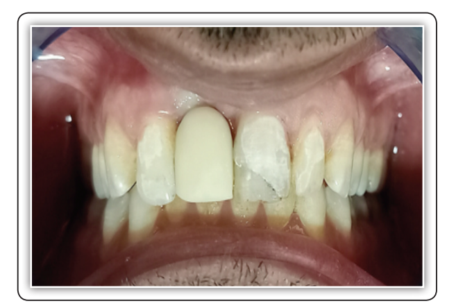
FIG (1) Upper right central incisor with VIT ENAMIC crown