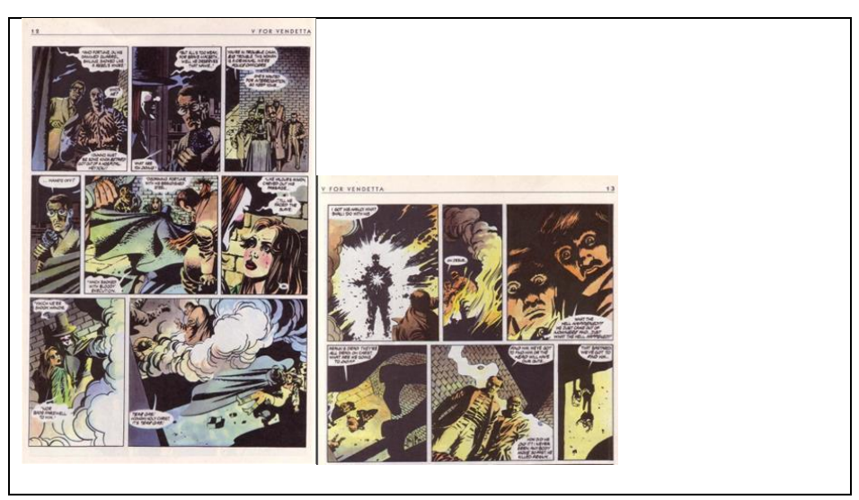
(Fig. (1) - Moore 10-13)

Here, the choice of moment is perfect; it shows what matters and directs the reader where to focus as fear prevails the scene. In transitioning from one panel to another, subject-to-subject transition is utilized, while changing angles of view to direct reader's attention to Evey's terrible fear of the fingermen. It is suggested, "This is where the power of subject-to-subject transitions lies: the ability to facilitate thought imagination through and reader participation." (McCafferty, Art Ducko) Thus. transition accentuates Evey's fear; Evey does not resist of fight her attackers, she is grabbed by fear.