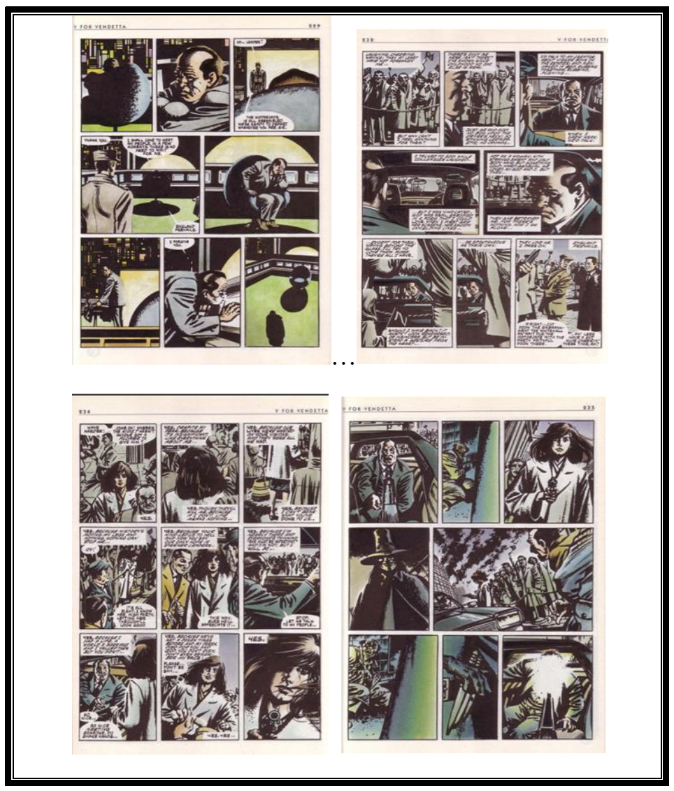
(Fig. (3) - Moore 148-55)

In these panels, the choice of moment changes from action to action to subject to subject. The action to action transition focuses on the defeated Susan, as V's hacking of Susan's computer "Fate" has left him experiencing fear and uncertainty. The transition changes to subject to subject as