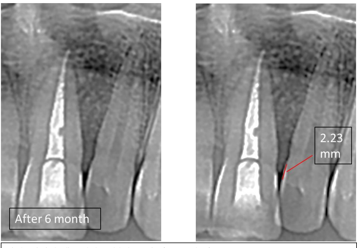
Fig.4. periapical radiograph showed the bone gain after 6 months after treatment.