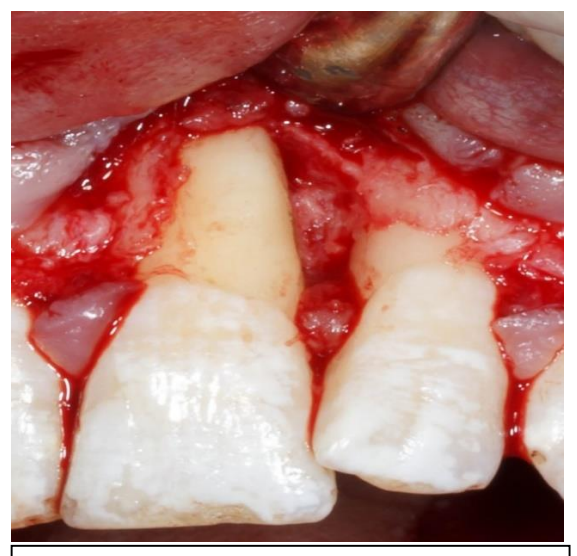
Fig.1. showed infra bony defect related to the mesial surface of upper left central incisor.

Similar superscripted letters within same row denote significant difference between groups