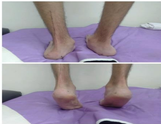
Fig. (1) Heel Raise Test.

Heel Raise Test to Confirm the Flexibility. Arch is restored and heel valgus is corrected while Tip toe standing. Fig no 1