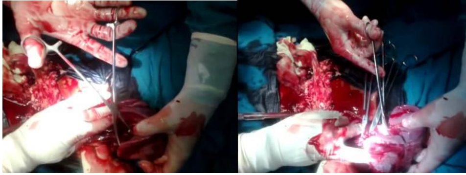
Fig. (1): Clamping of splenic pedicle during total splenectomy.