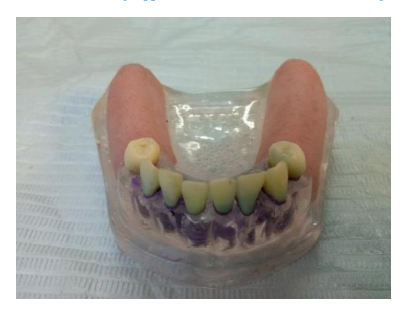
Fig.1 Standardized 2 mm thickness of simulating mucosa was fabricated.