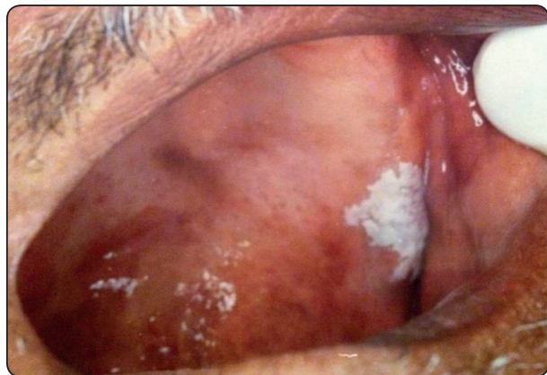
Fig. (3) Oral leukoplakia.