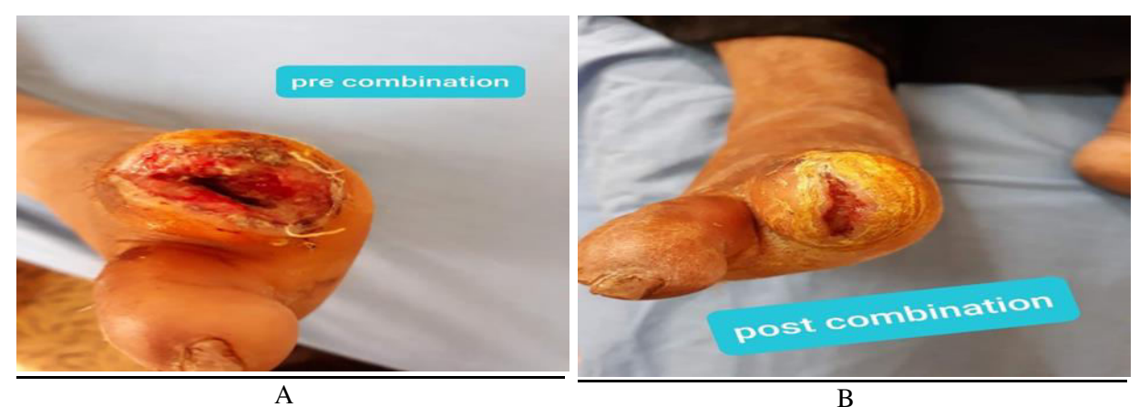
Fig.1. The differences in wound volume pre and post cryotherapy application

This plate shows the improvement of the wound volume and appearance after cryotherapy treatment. (volume = 18.5)