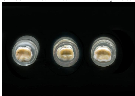
Figure 1. Preparation of three designs

The occlusal reduction for three groups was set at 1 mm, following the indications about the minimum occlusal thickness for the final restoration given by the manufacturer of the materials used in the present study, lithium disilicate CAD/CAM blocks, zirconia blank and hybrid ceramic.