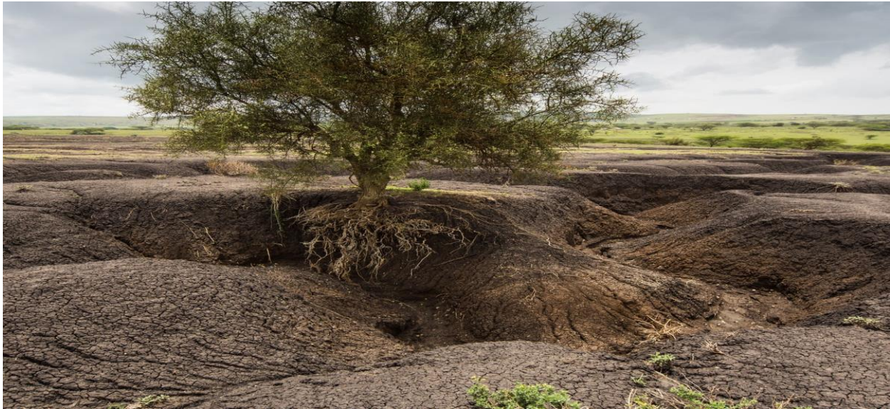
Figure 1: Land badly degraded for human sustainability

dammed surface water that is able to serve 250 km 2 at inception but over time could no longer serve the entire area again could be attributed to anthropogenic and natural effects which have led to the degradation of the dam environment. The causes of the degradation could be multifarious including increased sedimentation of the dam as a result of surface erosion (the event which may lead to reduced water volume of the reservoir); it could be as a result of the removal of vegetation in the vicinity of the dam environment, farming activities and aging trees could all contribute to the degraded value of the dam. A similar scenario is peculiar to soil resources.