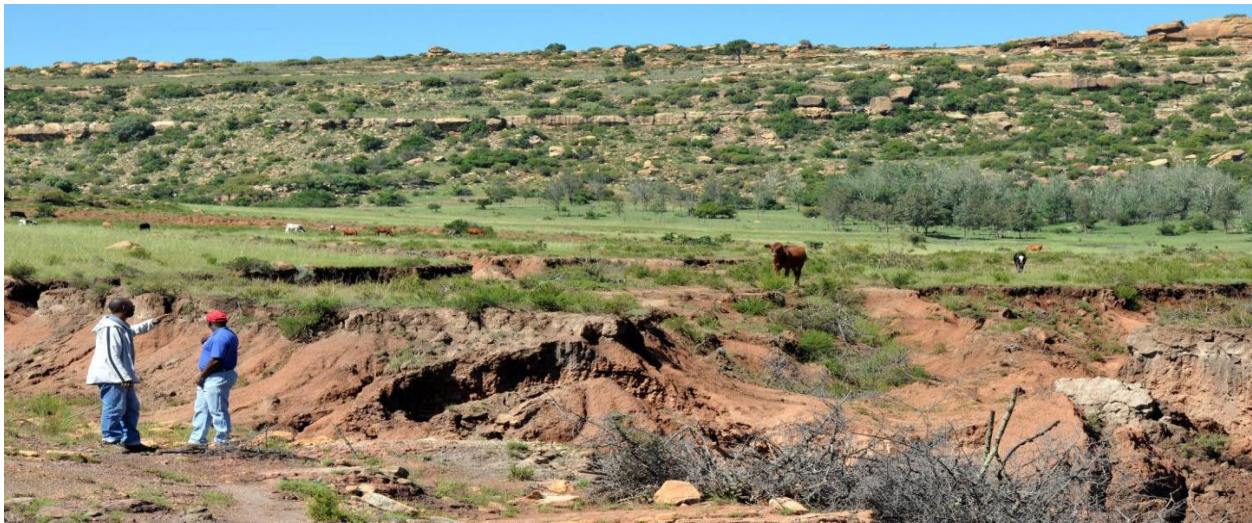
Figure 2: Footprints of degradation resulting from deforestation

Soil Compaction in the Savanna belts: Similar to the experience in forested areas is also the scenario of what happens in a Savannah environment where effort is not made to checkmate over-utilization of savannah land resources. This region easily degenerates into desert as a result of scanty or lack of tree cover over time. There are reports to support the challenge of desert encroachment in the Sahel and Sudan savanna ecological zones in Nigeria (Macaulay, 2014; Olagunju, 2015; Saulawa et al. , 2018; Yahaya et al. , 2018). This experience is attributed to the continuous utilization, extensive and intensive use of the land resources in these zones. Desertification, otherwise described as land degradation becomes easily established as a result of the open land's treeless terrain. Several efforts are being made to convert such open lands into forest through tree planting programs to enhance and empower wind movement breaking. Also associated with overuse and exposure of savanna land is soil compaction. Development of hardpan can easily set in as a result of such exposure. At times the loose and/or granulated topsoils are removed either by wind or water erosion leaving the hard sub-soil which could be agriculturally unproductive, otherwise described as a degraded resource (Saulawa et al. , 2018).