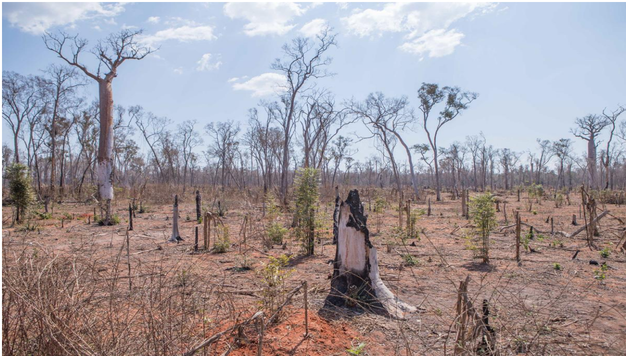
Figure 3: Consistent soil tillage results in loss of biodiversity

Long distance eye-view in the formerly forested areas: Another clear footprint of a degraded environment is the ability and ease of sighting long distances in an environment that was formerly covered with trees/forest. When trees are removed without systematic replacement over time, it becomes possible to cover distances in human view because what was obstructing the view in the first instance such as trees, herbs and other plants have been removed. This is to say that environmental degradation makes it possible to view distances except otherwise hindered by rocky or rough terrain. Ibrahim et al (2018) had reported that despite the efforts to combat degradation of land along Nigeria-Niger border region, the treeless situation which gives room for the ability to view distances. Thus, suggesting that forest conservation should be allowed to thrive in the region.