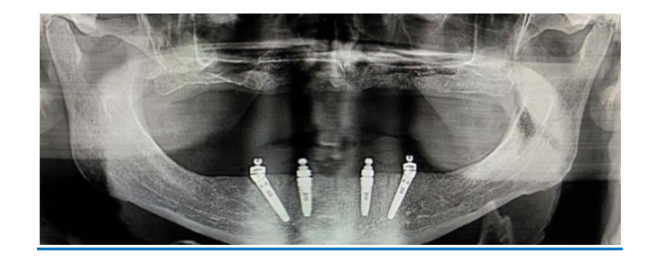
Group B:4-implants with all on four design