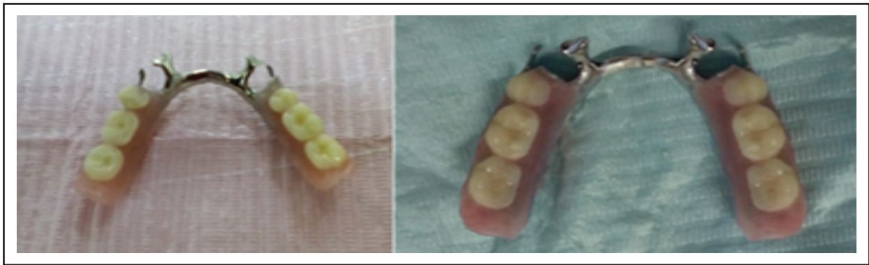
Fig. (1): Left: Finished RPD with flexible base, right: Finished RPD with O.R base.

formed at the time of denture insertion, three, six and nine months after insertion.