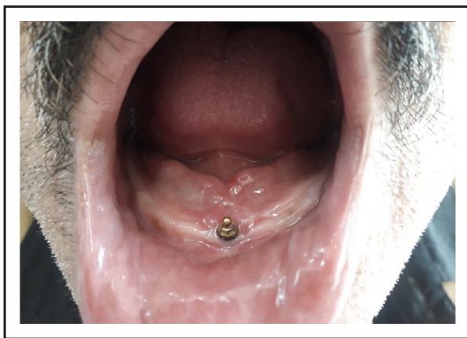
Fig. (1b) Patient has single implant with ball and socket attachment at a symphesial region