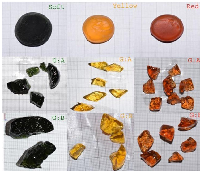
Figure 1: showing pattern of cutting in both groups using the three consistencies of SCT in which G:A stands for Group A and G:B stands for Group B

SD: Standard deviation, P: Probability level, *: Significance