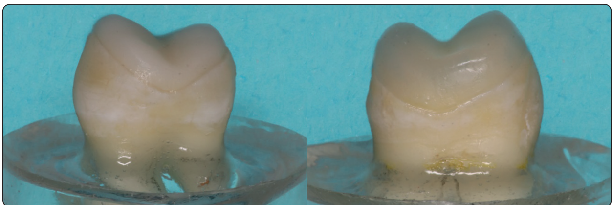
Fig. (2): Specimens after cementation.

All specimens were loaded vertically till fracture in a universal testing machine (Model 3345, Instron, USA). An indenter with 6mm diameter was used to apply compressive load perpendicular to specimens along their long axis with a crosshead speed of 1mm/min till fracture. (5) To distribute loads evenly, a 0.5 mm tin foil was positioned between the indenter and the specimen. The load needed for fracture of each specimen was recorded automatically in Newtons (N) using a special software. (18)