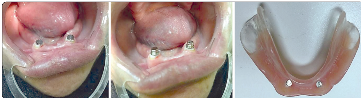
Fig. (3) a) Two ready-made magnetic keeper cemented intra radicular in each canine, b) Magnetic attachments attached to its keepers, c) magnetic attachments in denture intaglio surface.