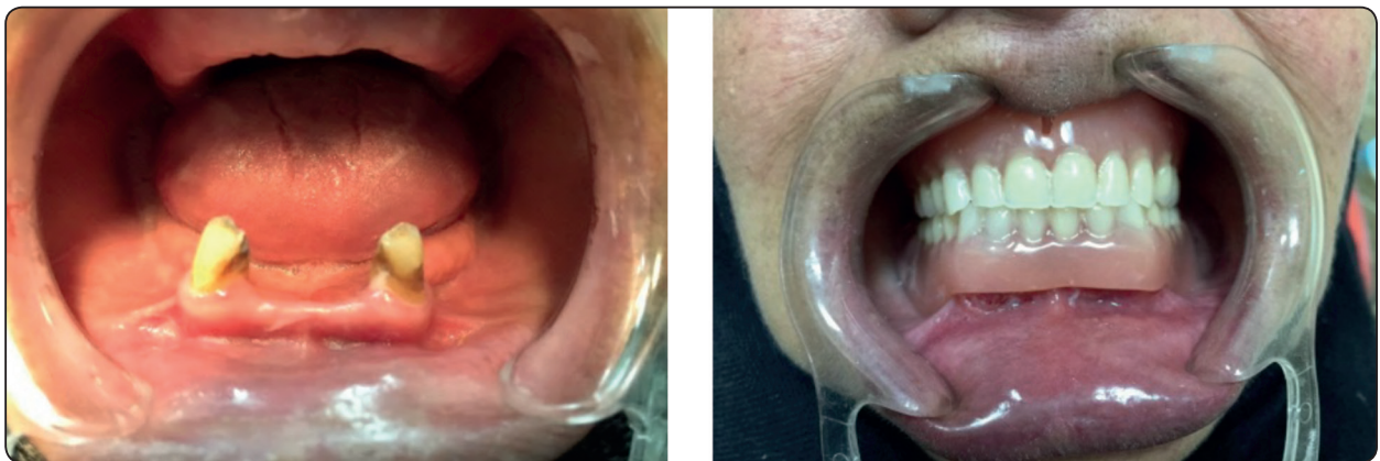
Fig. (1) a) Complete edentulous maxilla opposing mandibular partially edentulous arch with remaining two canines, b) Maxillary denture & mandibular tooth supported overdenture after necessary adjustments & occlusion refinement

A rubber spacer (supplied with ball attachment) (figure 2b) or piece of rubber dam was 1-inch square cut was applied on the patrix. Then the attachment matrix were attached to the Patrix (figure 2b, 3b), then the intaglio surface of lower denture was checked in place (using pressure indicating paste) for pick up space availability., then attachments were picked up (using chair side acrylic resin in one side at a time) (figure 2c, 3c), then the occlusion was checked for possible premature interferences or deflective contacts and the denture was delivered (figure 1b).