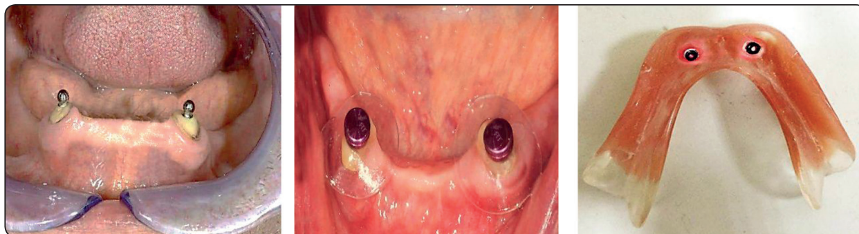
Fig. (2) a) Two ready-made ball attachment cemented intra radicular in each canine, b) metal socket with O-ring attachment before direct pick up procedure, with clear nylon spacer in between, c) O-ring attachments in denture intaglio surface.

The digital software (CorelDraw® 10, Kodak Digital Science) was used to calculate the marginal bone level according to Preus et al (47) (figure 5b). Using the magnification error calculated from the metal ball known dimensions, the change in the bone level in each year was calculated and tabulated. The mesial and distal changes of the two abutments were gathered and the average of the 4 measurements was used.