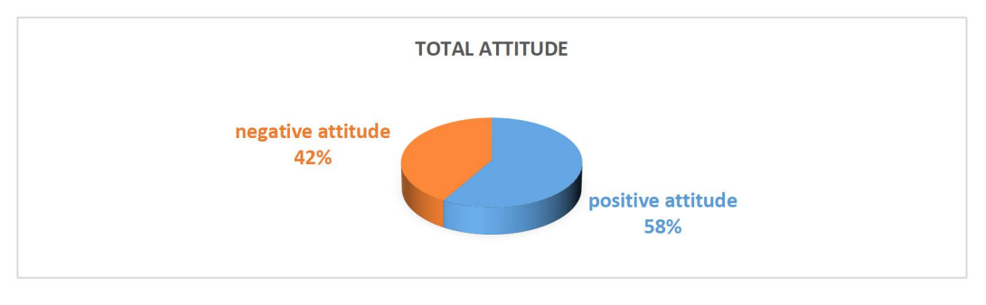
Part II: Figure (2):Nursing students' total attitude toward first aid measures.

** unsatisfactory knowledge level \leq 70\%