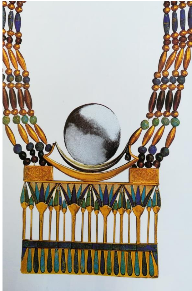
[FIGURE 2]: The center part of Tutankhamun's necklace, jd'E 61897, The Grand Egyptian Museum, JAMES 2000: 211