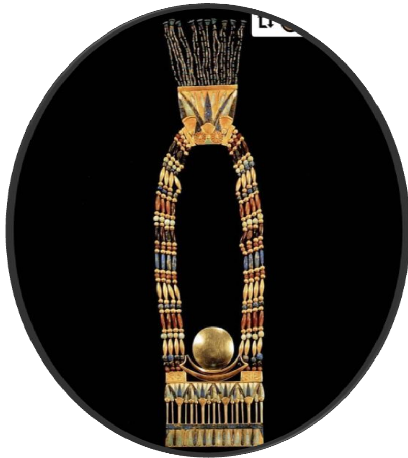
[FIGURE 1]: Tutankhamun's necklace jd'E 61897, The Grand Egyptian Museum.