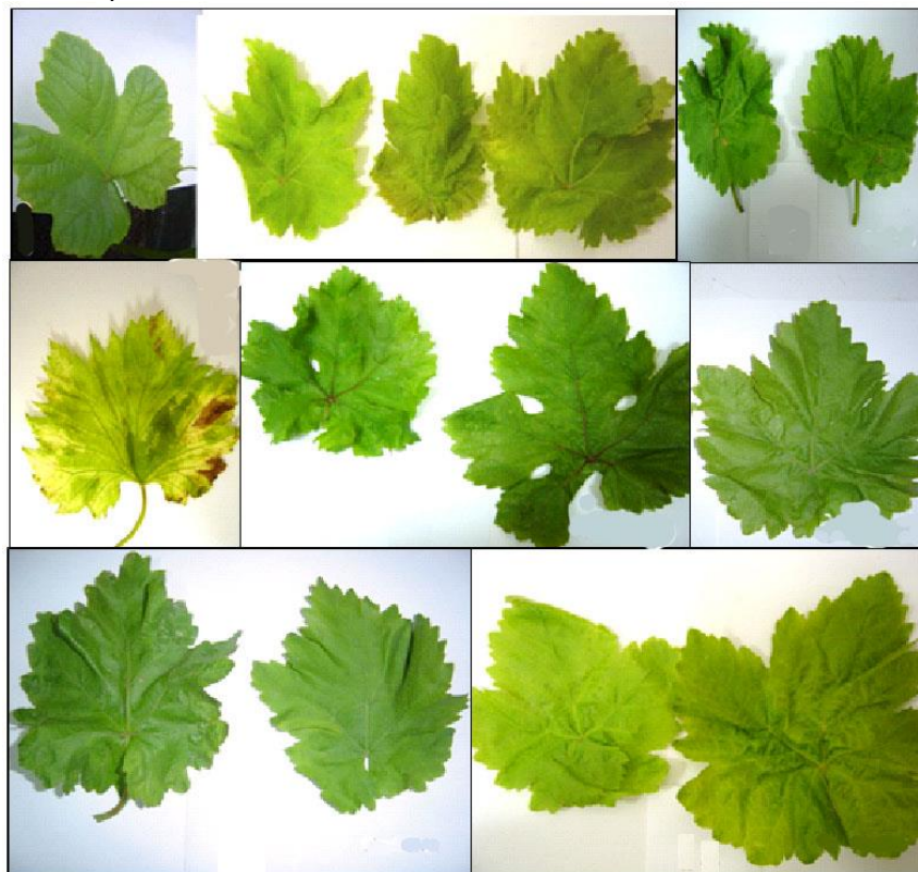
Fig. 1: Different selected shapes of grapevine symptoms collected from native, imported and rootstocks grapevine fields in different locations in Egypt during March and April 2005, in which yellowish, mosaic downwards rolling, deformation and twisting leaves were recorded.

The most frequent symptoms of grapevine virus diseases collected from grapevine fields in different location in Egypt during March and April 2005-2006 in which native, imported and rootstocks grapevine tree cultivars were illustrated in (Fig.1) which appeared as a yellowish, mosaic and downwards rolling of the leaves, deformation and twisting on the leaves in addition to poor coloration of the leaves.