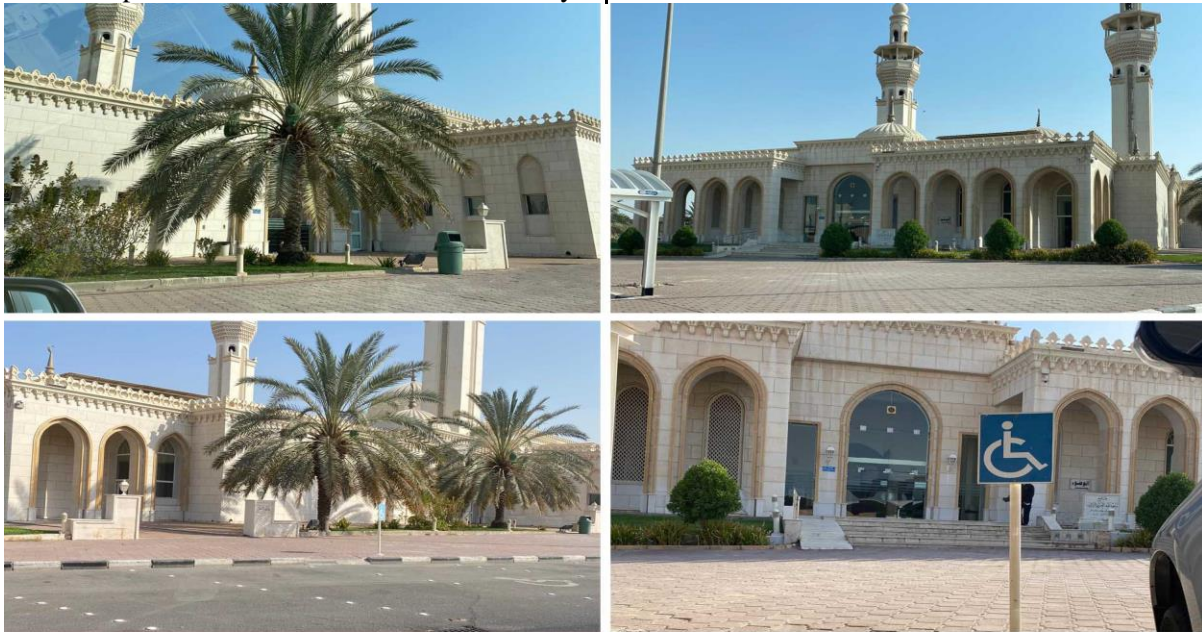
Figure 1. Al Rashid Mosque at the capital Governorates(the Author).

There is mostly a central mosque in each neighborhood in Kuwaiti and primarily located within the main public utility center that the government provides in each governorate. The author selected one main mosque from each of the six governorates of Kuwait, as these main mosques are the most used for daily prayers, plus the Friday congregational prayers. In doing so, the author sought to show a representative sample on the condition of mosque design in Kuwait.