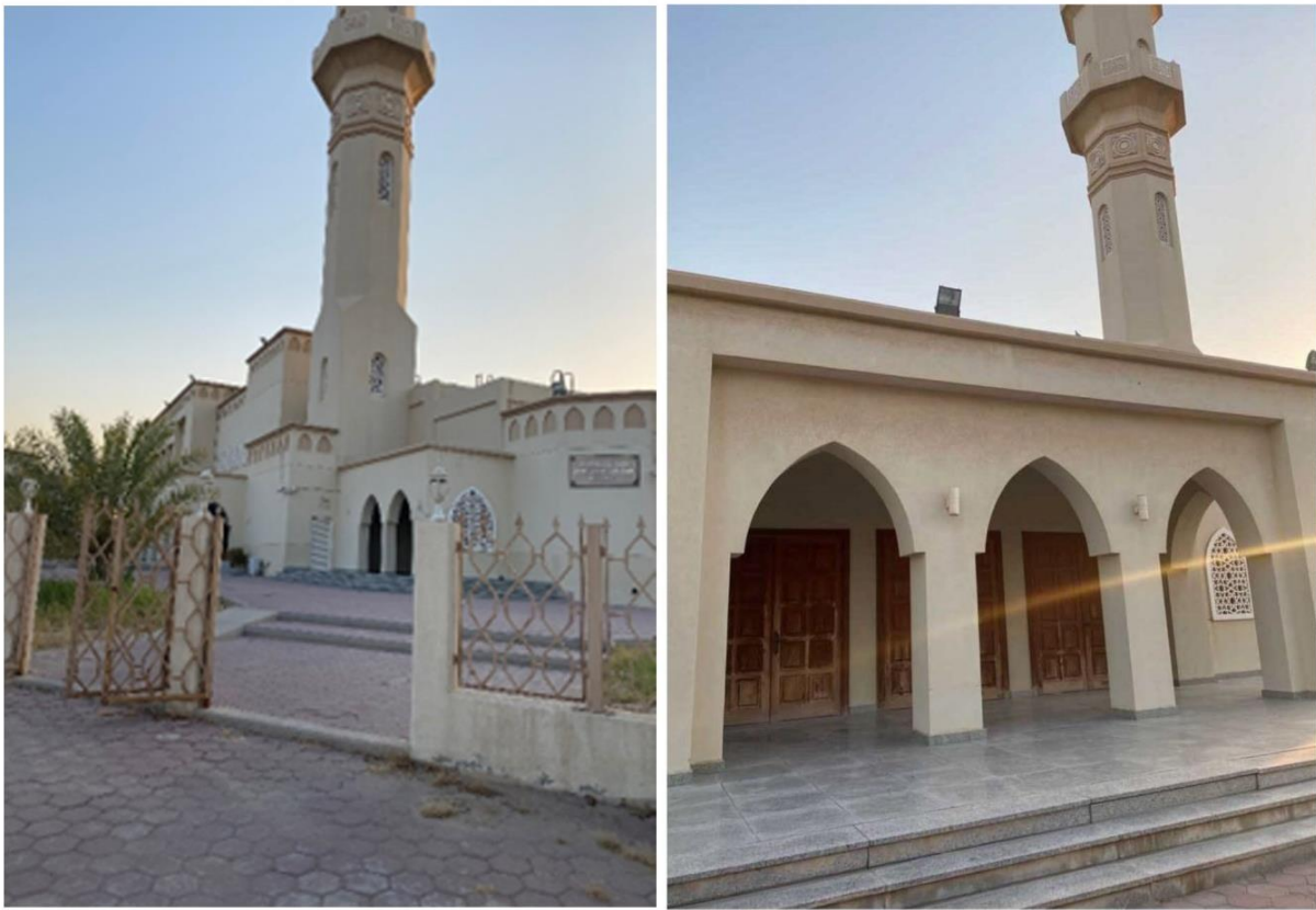
Figure 5. Douig Al Salman Al Sabah Mosque at Ahmadi Governorate (the Author).