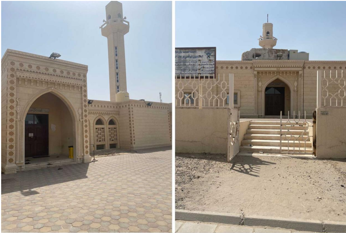
Figure 3. Al Ala Ibn Oqba Mosque at Farwaniya Governorate.