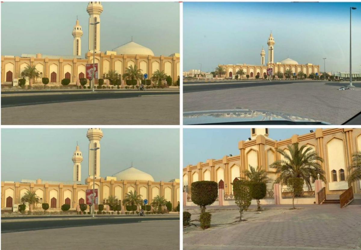
Figure 6. Omar Ibn Omair mosque at Mubarak Al-Kabir Governorate (the Author).