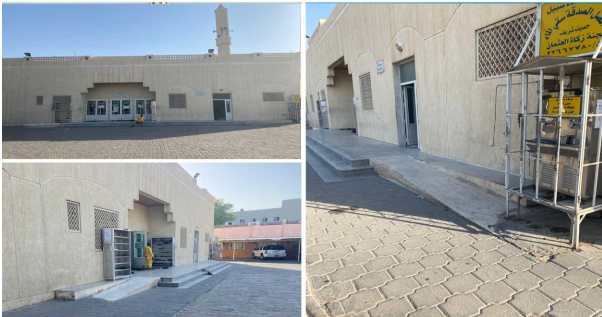
Figure 2. Al Balool Mosque at Hawally Governorate (the Author).