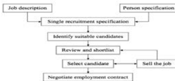
Figure (1) Recruitment & Selection Process (Sudhamsetti & Raju, 2014)

Career planning is an essential step in the process of helping individuals with disabilities to reach their employment goals. Career planning creates a road map for the employment process (Institute for Community Inclusion, 2012). Career planning helps organizations to deal with different changes proactively rather than reactively. Last but not least, career planning process can be expressed by the next figure.