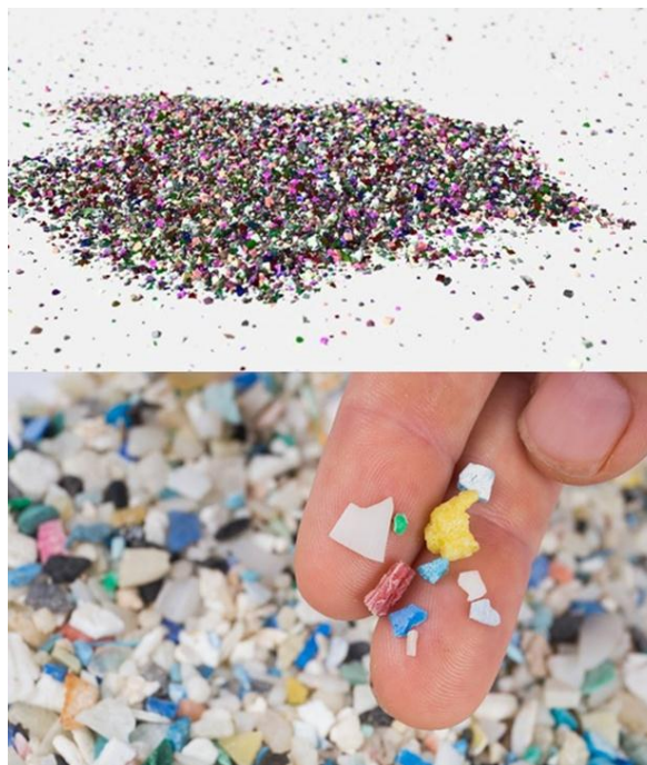
Fig. 1. Microplastic particles

The sources of MPs will differ from ecosystem to other (Fig. 2). The defragmentation of larger plastics on coasts owing to oxidation, heating, and radiation is the primary source of MPs in the aquatic environment (Palmer and Herat, 2020).