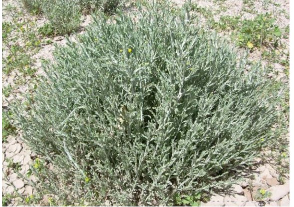
Figure 1: Pulicaria crispa at the site of collection in the Egyptian Western desert.

Pulicaria crispa - locally known as gethgath- is an annual herb or sometimes a perennial shrub; ascending and often with hemispherical appearance, 12-75 cm high, intricately and densely branched from the base with stems closely white-wooly tomentose. Leaves are sessile, somewhat amplexicaul, narrowly linear, acute to obtuse, undulate to rarely toothed, wooly tomentose on both sides or glabrescent, 0.5 -3 \times 0.15 - 0.3 cm and much smaller on the upper stems. Heads are solitary-terminal, hemispherical, heterogamous, radiate, and golden-yellow to orange, 0.5-1 cm across. Bracts are many-seriate, imbricate, linearlanceolate, acuminate, and glabrous to ciliate. Ray florets; in a single marginal row, small, as long as disc florets. Achenes are 0.5-0.9 mm, brown and glabrous. Pappus contains 7-10 bristles; it is 2-4 mm long, fused at the base (5, 6).