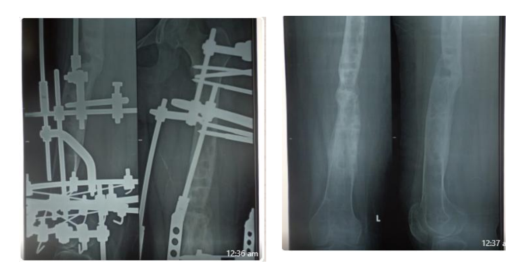
After one stage protocolAfter removal of ilizarovFigure 2: One-stage protocol case 1: After 9 months of non-union