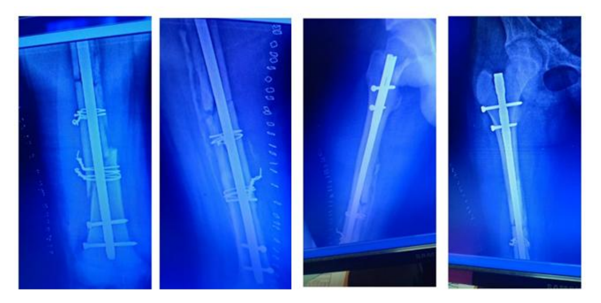
Nail was removed, debridement carried out, then rush pin and cement with antibiotic was inserted until infection was healed.

group was Quadriplasty (30%). In the twostage group, it was Quadriplasty (20%), Bone graft (20%) & revision of fixation (20%) of cases, as shown in Table 3.