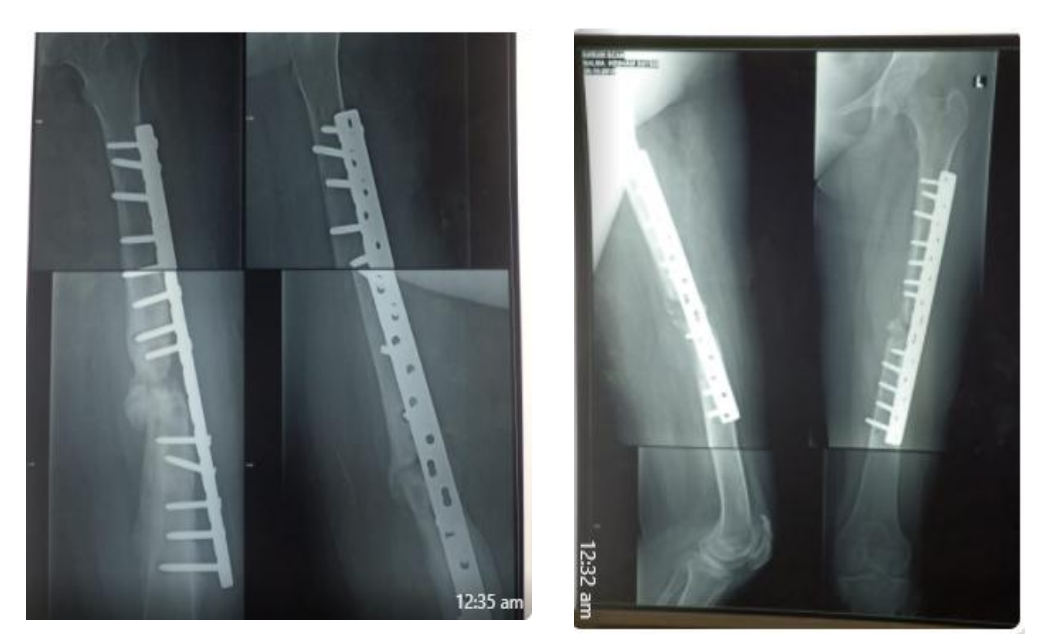
After 9 months of non-union