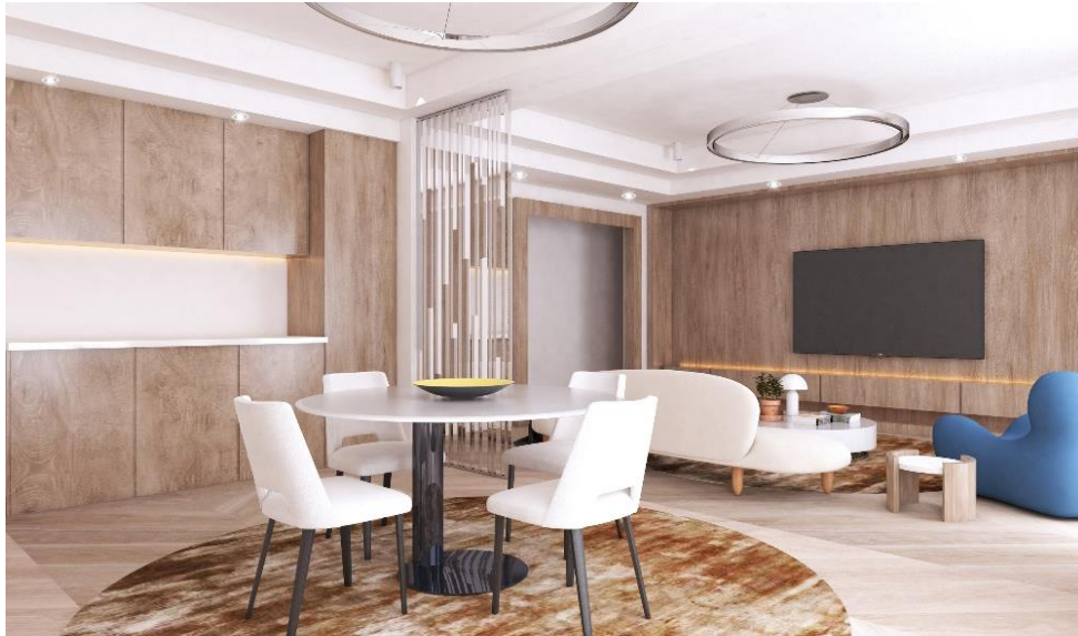
Picture no (17) shows the use of different materials, wood, varnishes, and the most important metals such as stainless

5- The furniture reflects the power and achievements of ultramodern thinking with curved lines, the use of wood, stainless steel, and the installation of interior lighting for some furniture to give them an aesthetic value.