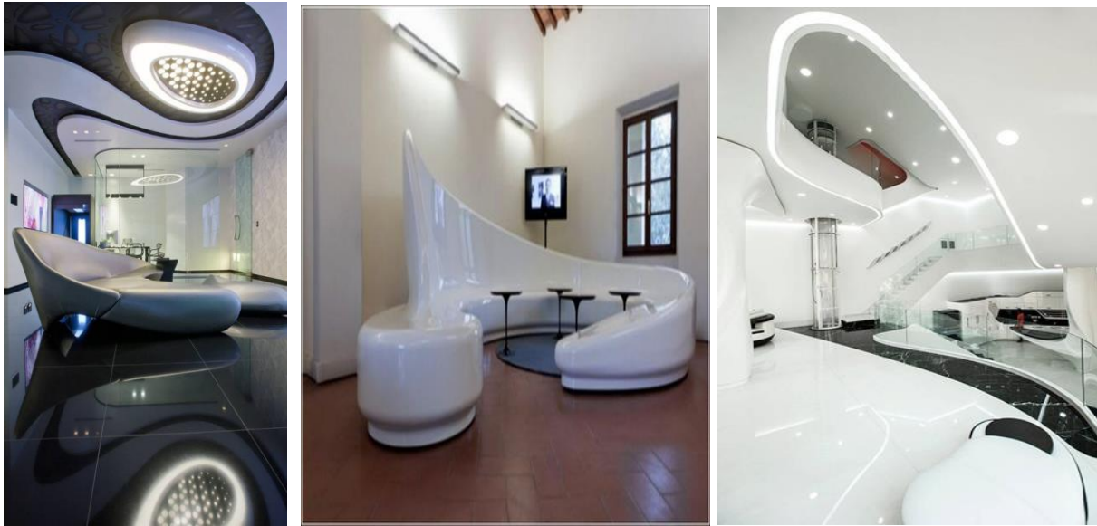
Picture No. (9,10,11) shows the usage of streamlines and modern techniques of materials and indirect lighting with colors to express the design of the ultramodern.