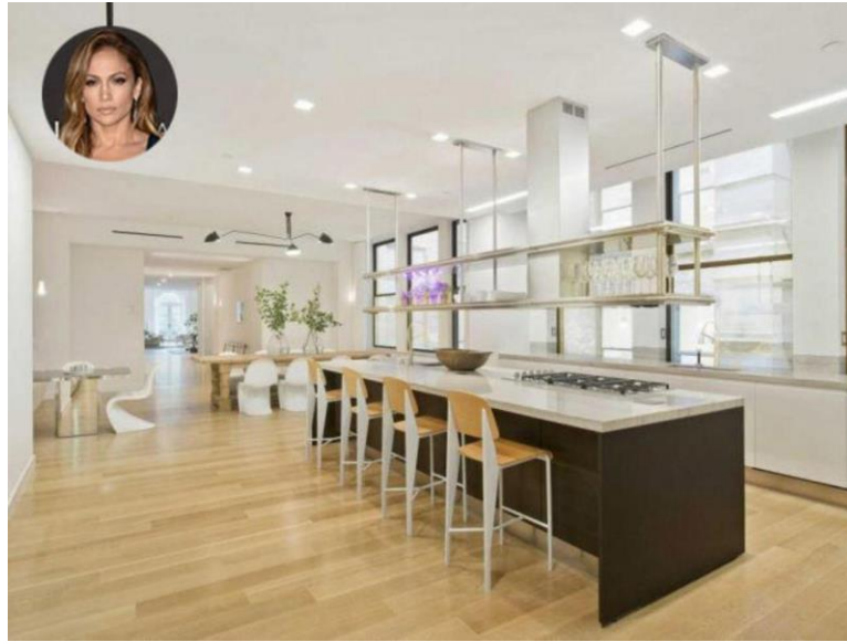
Picture no (14) showing the kitchen of famous actress Jennifer Lopez based on the thought of ultramodern

In Jennifer Lopez's Manhattan apartment, the kitchen was designed by the renowned Italian design company Arklenia, without the owner's touches, represented by a green plant. There, the vaults look hidden, while the pair of stainless steel shelves, with two shelves dishes and cups on the island, are converted to the simple contemporary style.