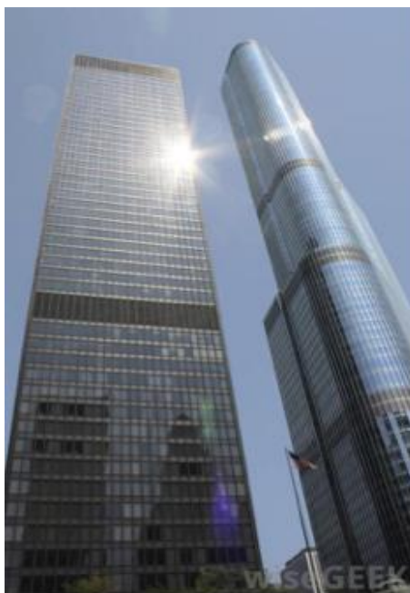
picture no (4) showing the difference between the contemporary architectural style (on the right) and the modern style (on the left)