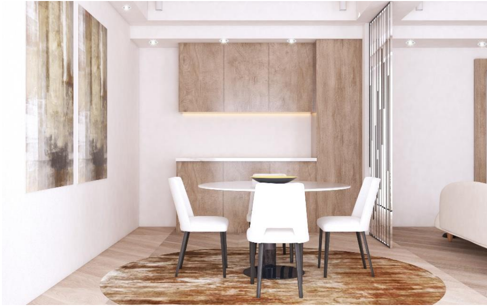
Picture no (19) shows the Curved furniture and optimal use of architectural space.