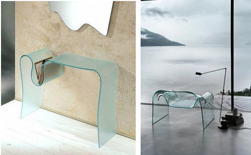
picture (5,6) shows two models of tables designed by Italian designer Bardini It made of glass with the ripple design lines of ultramodern thought