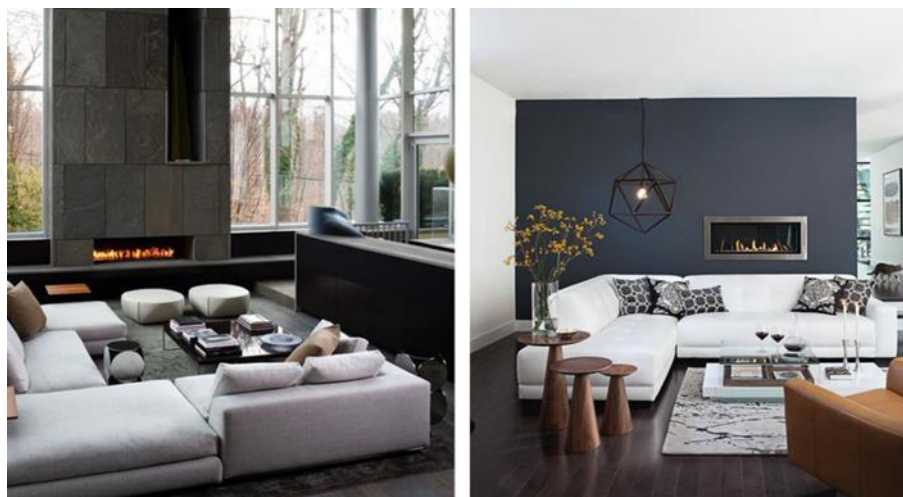
picture No. (3) shows the colors and architectural elements in contemporary design