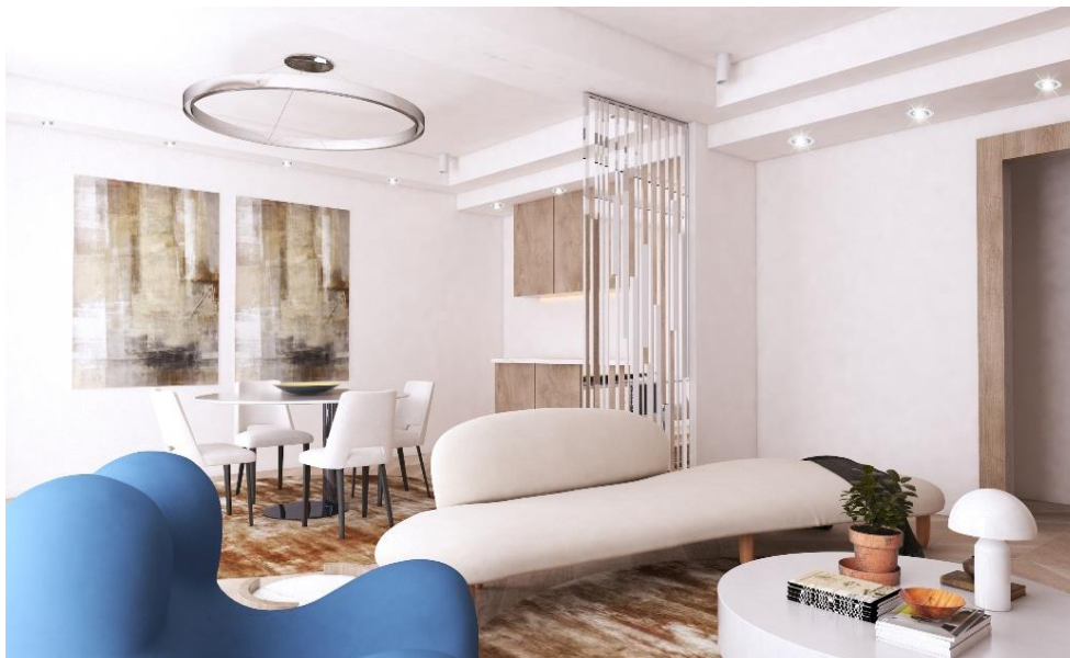
Picture no (18) shows the Use of different colors, white, natural colors of wood, and the addition of touches of blue