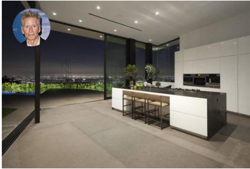
Picture no (16) shows the kitchen of famous Calvin Klein based on the thought of ultramodern

The kitchen is radiating at the home of renowned American fashion designer Calvin Klein in Florida, especially since white controls his shiny lockers. The kitchen has a welcome space, and Isle has a grey surface aligned with electrical tools from the Stainless Steel.