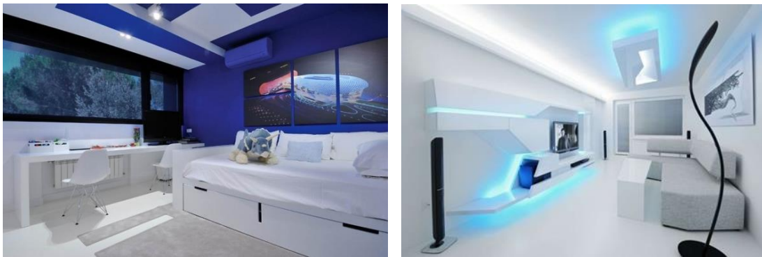
Picture No. (12,13), shows the usage of contrast using (black and white) and (white and blue) and indirect colored lighting in the ultramodern design.