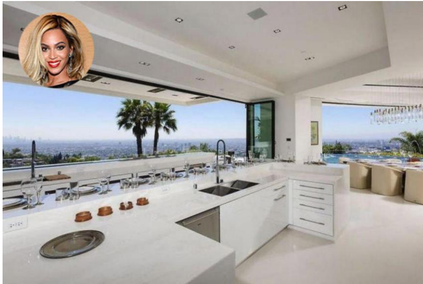
Picture no (15) shows the kitchen of famous Beyoncé based on the thought of ultramodern.

In Jennifer Lopez's Manhattan apartment, the kitchen was designed by the renowned Italian design company Arklenia, without the owner's touches, represented by a green plant. There, the vaults look hidden, while the pair of stainless steel shelves, with two shelves dishes and cups on the island, are converted to the simple contemporary style.