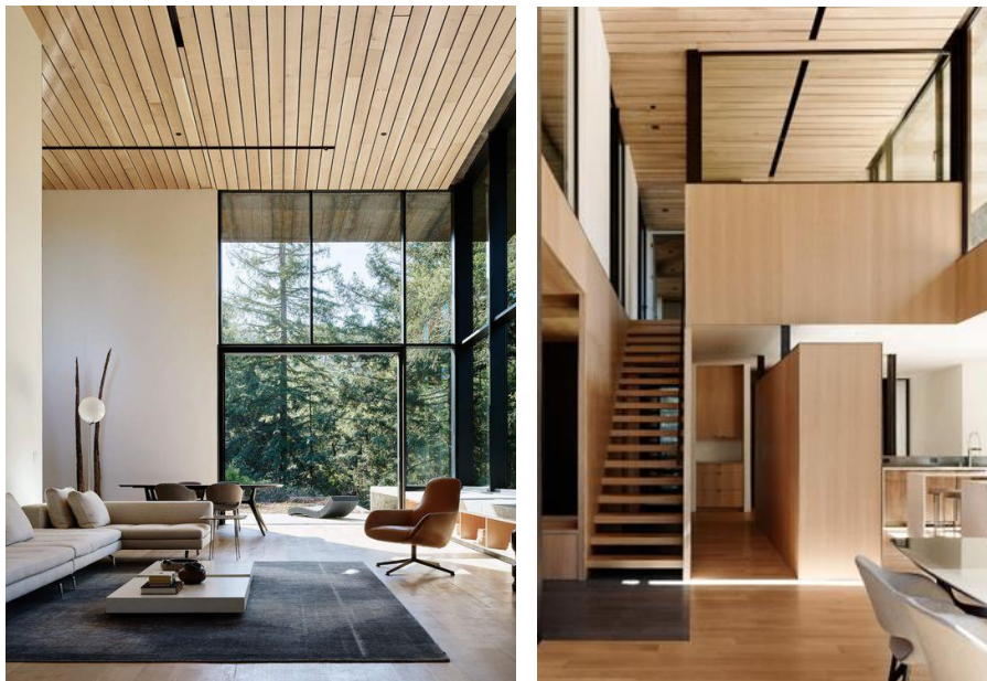
Picture No. (7,8) Emphasis on the visibility of architectural elements and the use of sustainable natural materials, with emphasis on the provision of energy used in expressing the ultramodern thought in an Ultra-Modern Home in Orinda, California by Faulkner Architects.