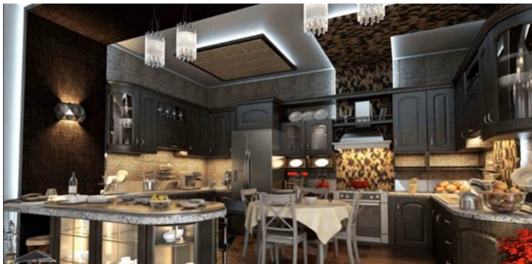
Picture No. (2) shows the most materials which are used contemporary design