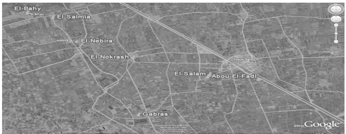
Figure 2. Google Earth map showing the studied villages and sampling sites in Etay El-Baroud district, Behira Governorate, Egypt