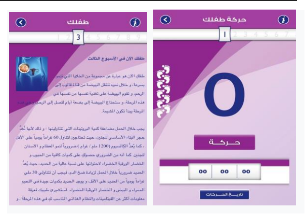
Figure (2): Screenshots of mobile app contents

Evaluation: The researchers assess the level of MHLAP questionnaire two points of time: Baseline that before intervention and eight weeks later after performing the proposed intervention. Either MHLAP questionnaire and satisfaction level were evaluated.