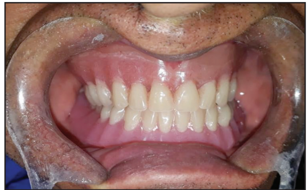
Figure (2) 3D printed upper denture with lower conventional denture after delivery.

The denture bases were printed according to Digital Light Projection (DLP) technology using Next-Dent Base liquid which is a monomer based on acrylic esters using Mogassam 3D printer. After the whole printing process was completed, the printed denture bases were rinsed in 99 % isopropyl ethyl alcohol. After cleaning and drying of the printed denture bases. They were placed in an UV-light curing device for fifteen minutes for the final cure. The support structures were then removed, and the printed denture base were finished by fine bur and rotary tool then polished using Abraso-gum Acryl.