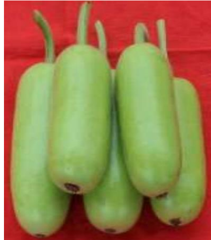
Fig. 4. Kashi Kirti variety of bottle gourd

that are green, small, and have cylindrical shape (Gutka type) (Fig. 4). They are resistant to Downey Mildew. Variety is early maturing and high yielding as compared to the check variety. The fruits are suitable for distant marketing and transportation due to better post-harvest life and are recommended for cultivation in Uttar Pradesh and are notified vide gazette notification number S.O. 692(E), dated 05.02.2019 (IIVR, 2019).