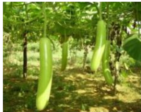
Fig. 5. Kashi Ganga variety of bottle gourd

Kashi Ganga variety of bottle gourd obtained from the cross IC-92465 x DVBG-151. The colour of its fruits is lightly green of about 30cm in length, 7cm in diameter, 7cm and weight in the range of 800-900g and yield of about 80-550 quintal/ha. This variety is resistant to anthracnose, and thus suitable for the rainy and summer season and is cultivated in different states like U.P., Punjab, and Jharkhand (IIVR, 2019) (Fig. 5).