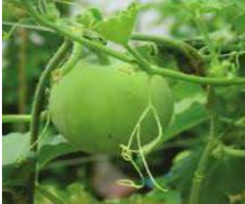
Fig. 2. Kashi Kiran variety of bottle gourd

The Kashi Kiran variety bottle gourd (Fig. 2) has light green attractive round fruits, tolerant to Downey Mildew. Each fruit weights around 600-700g. The number of fruits is 13-14/plant, with the average yield of 45-48t/ha. This variety is recommended for cultivation in Uttar Pradesh and notified vide gazette notification number S.O. 692(E), dated 05.02.2019 (IIVR, 2019).