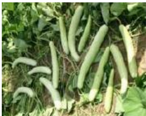
Fig. 6. Hybrid Kashi Bahar variety of bottle gourd

length about 30-32cm with green vigorous growth and vine, fruits are straight and light green in colour and the average weight in the range of 780-850g and yield 500-550 quintal/ha (Fig. 6). It is appropriate for cultivation in the rainy and summer season because it is resistant to anthracnose, downy mildew, and Cercospora leaf spot under field conditions and is cultivated in different states like U.P., Punjab Bihar, and Jharkhand (IIVR, 2019).