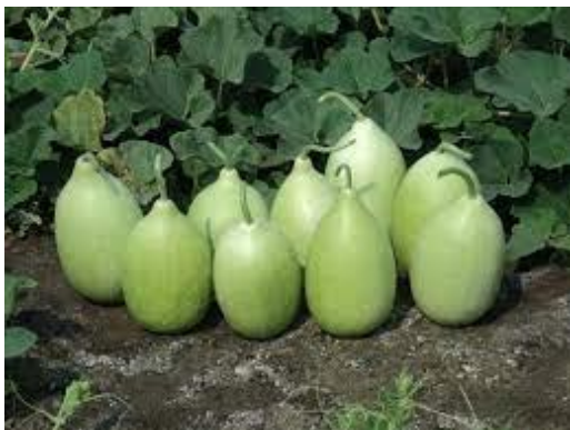
Fig. 3. Kashi Kundal variety of bottle gourd

They are attractive pear-shaped green fruits, medium in size (Fig. 3), suitable for sowing from July to September. The number of fruits is 12-14 per plant, with an average fruit weight of 1.3 to 1.5 kg. They are resistant to Downey Mildew. Better yield yield (47.5 t/ha) as compared to the check variety. This variety is recommended for cultivation in Uttar Pradesh and notified vide gazette notification number S.O. 692(E), dated 05.02.2019 (IIVR, 2019).