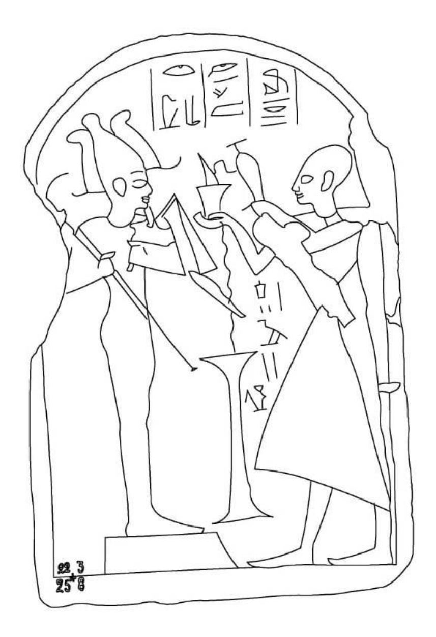
Fig.4. Line drawing of the Rounded-top Stela of Pi3y (by: Mohamed Ragab Ibrahim)