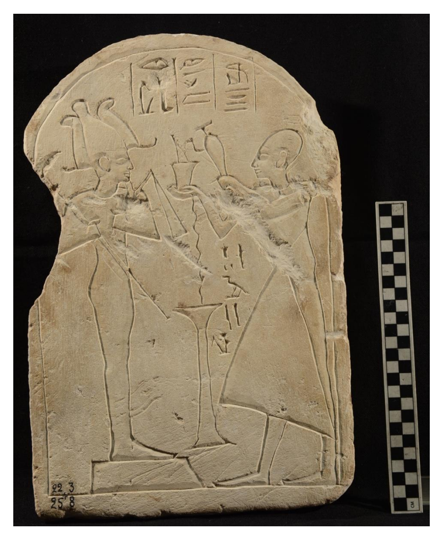
Fig.3. The Rounded-top Stela of Pi3y