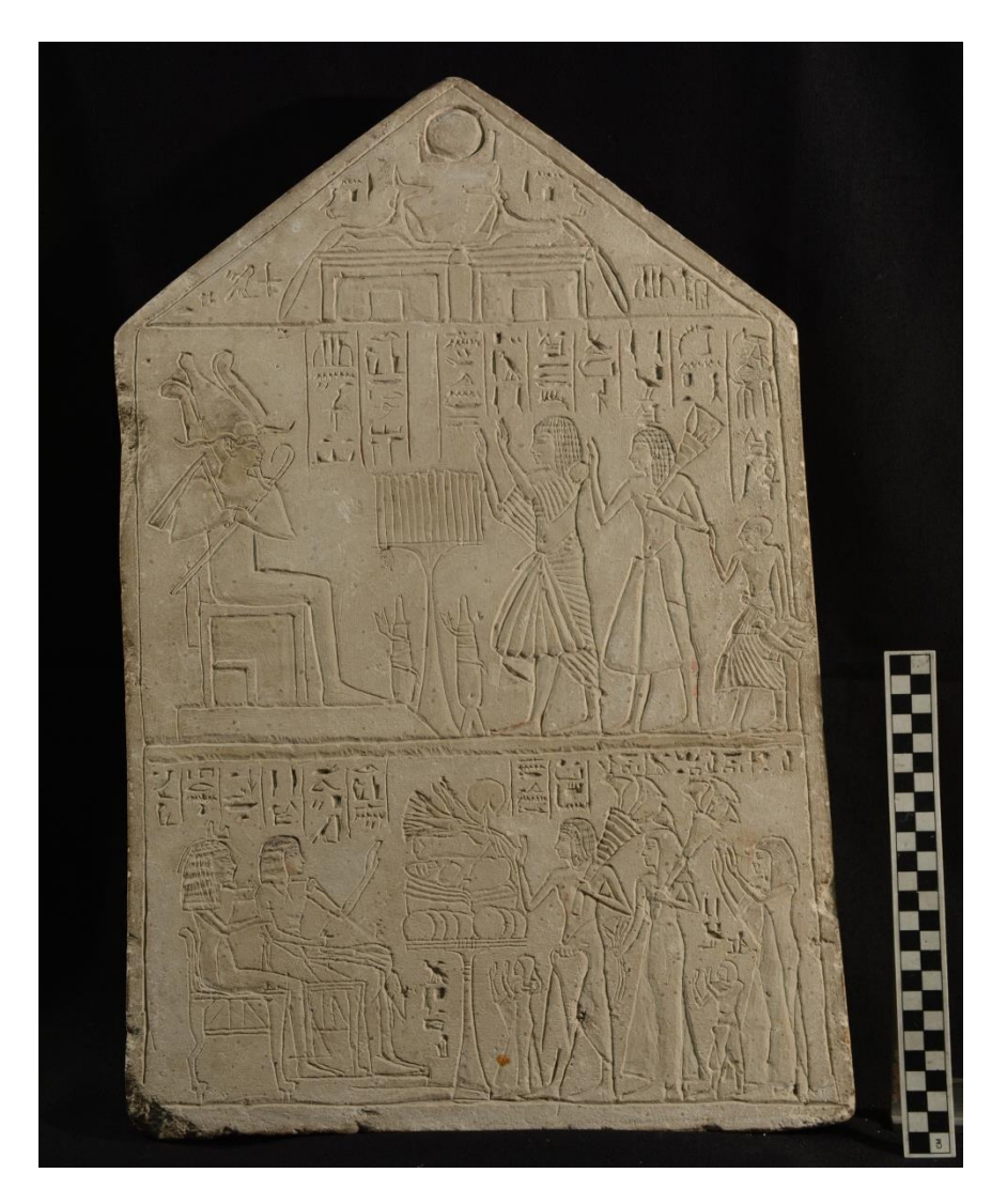
Fig.1. The Pyramidion Stela of Pi3y