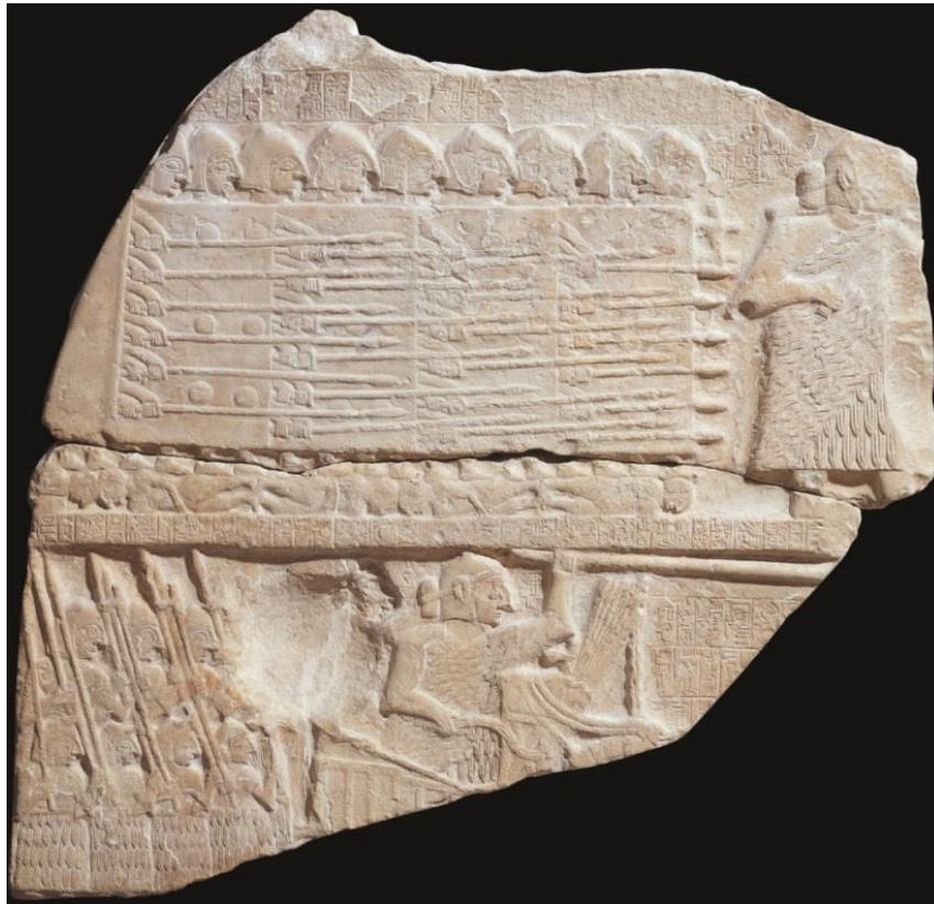
Fig 3 , one from a number of fragments of “Stele of Vultures”, Early Dynastic period , c. 2450 BC 3