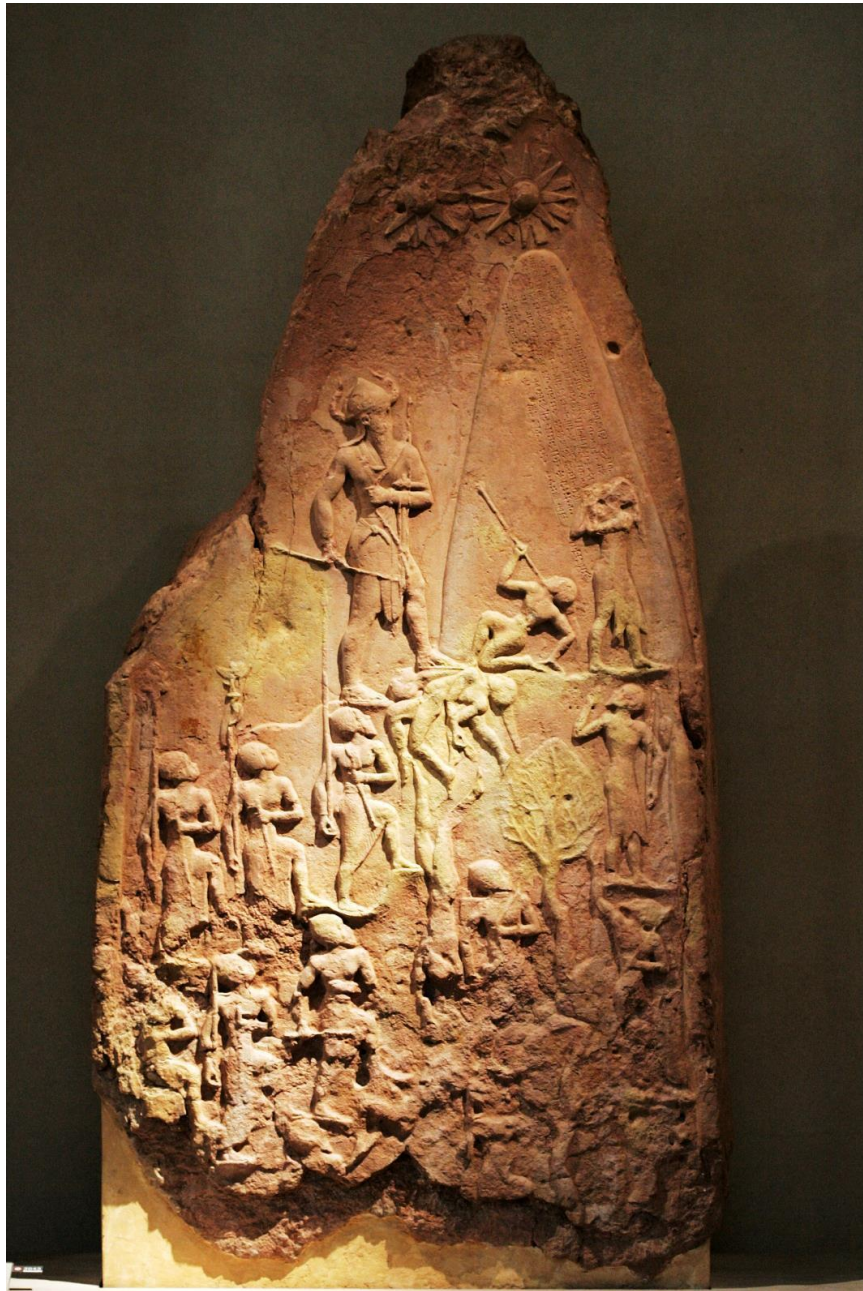
The Victory Stele of Naram-Sin Louvre museum, Paris