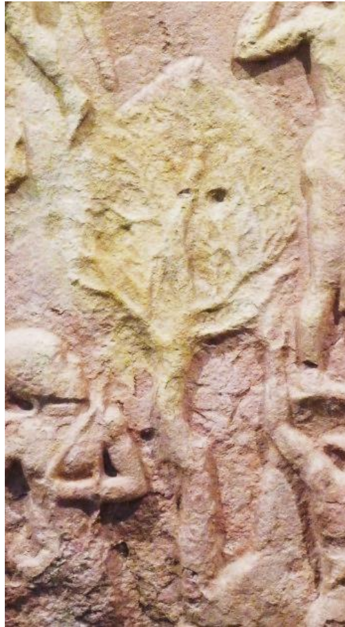
Fig 5 ,close image for the Oak tree

Although Naram Sin had the deification but he did not defeat his enemy alone , he was accompanied with the patronage of Gods to attest his divine power and he had the Akkadian strong soldiers and with much closer sight it can be seen, he put a blessed amulet around his neck. The triumph was not accounted as only a military victory, but also a political and divine wiling confirmation.