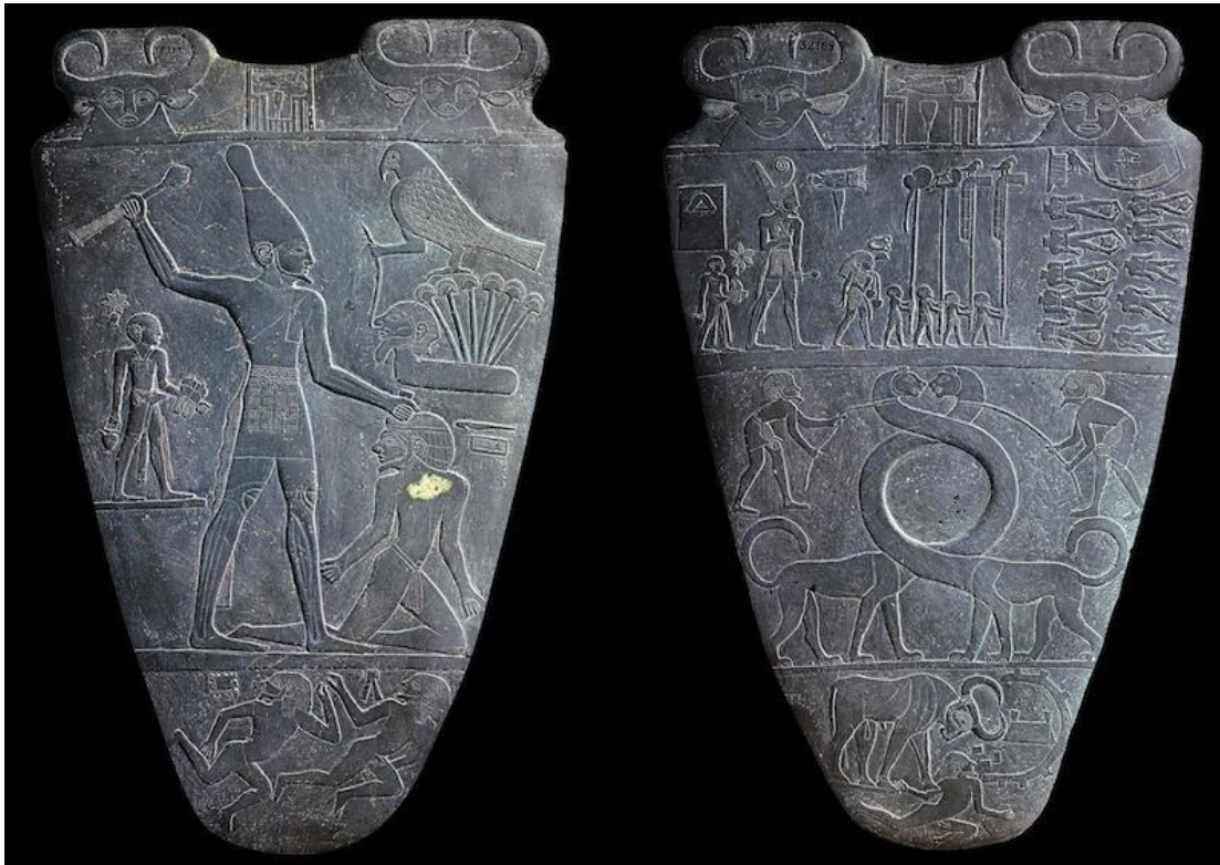
Fig 2- Palette of King Narmer, from Hierakonpolis, Egypt, Predynastic, c. 3000-2920 B.C.E., slate, 2' 1" high (Egyptian Museum, Cairo)