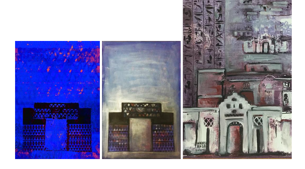
Fig. 10 and 11 Nubian house under the flood

Figures 8 and 9 are a transformation stage of the artwork in fig 7. It is generated by using CAD. The designer did not adopt the prospective rules in repeating the houses. The figure 9<sup>3</sup> shows the use of painting, wooden block printing (zigzag pattern) and stamps over the top of the printed canvas to develop the textures and repeating zigzag pattern on top of the houses and the background to express the Nile in order to portray the period before diminishing the Nubian land beyond the Aswan High Dam.