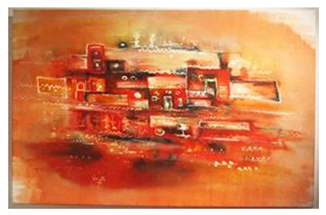
Fig.1: drawing on satin using disperse dyes, pigments

One of the methods that the researcher uses in her practice is to emphasise the role played by drawing in imitating the realistic look of the traditional Nubian houses which can give a special dimension to her art work in expressing the culture (fig 1). In figures 2 and 3 the researcher uses disperse dyes to draw Nubian house decorations to be transferred on fabric but she found that the stroke of the brushes and the colors of the dyes on paper have a better effect; they are more expressive than their effect if transferred on chiffon fabrics. In this method of using dyes, she tried another method called the itajime shibori technique with disperse dyes. This technique is implemented by using several metal pieces like circle shapes to present the woven basket on fabric as is shown in fig. 4. This gives the feeling of layering and transparency to present the disappearing culture.