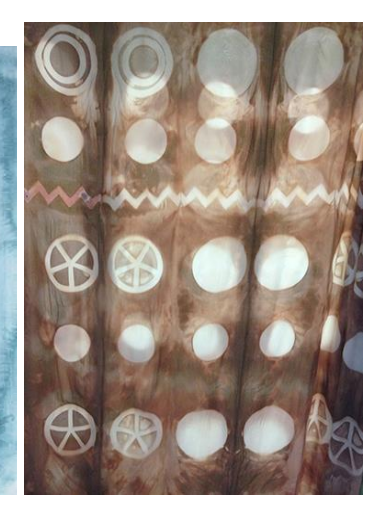
Fig. 2,3: using pastel oil and disperse dyes on paper Fig. 4: Nubian symbols & itajime shibori technique