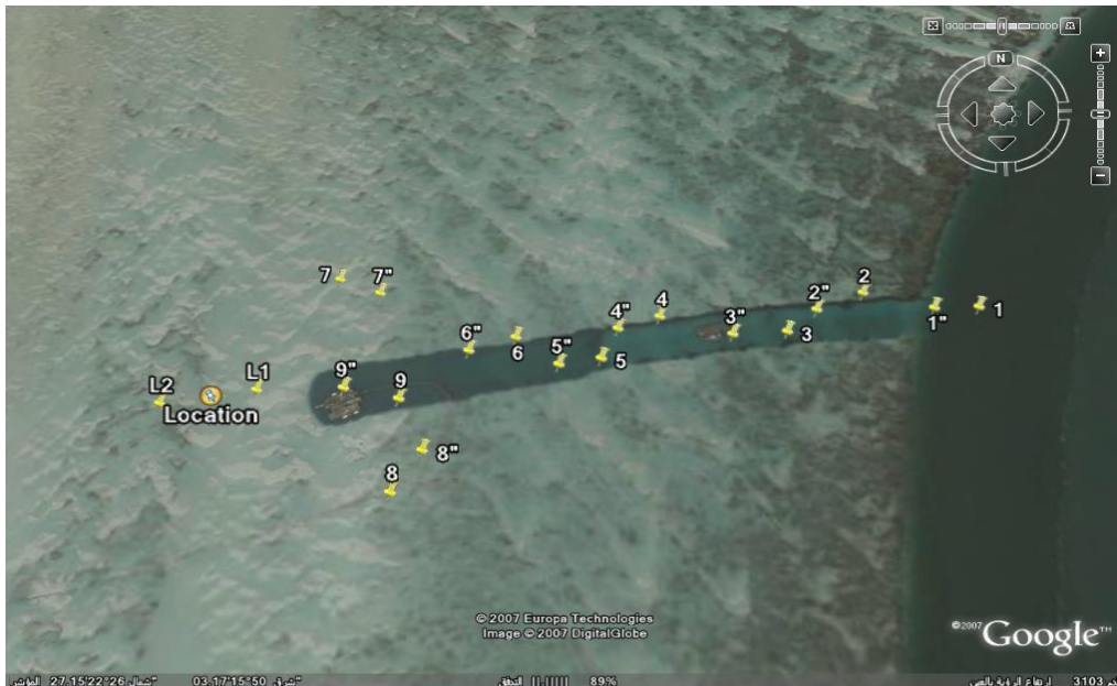
Fig (2): Marine Chanel, the gulf, and lake marine water and sediments samples' sites.