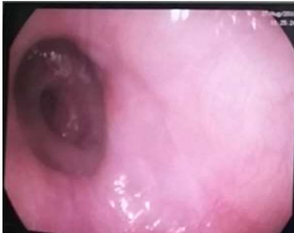
Fig 1: Endoscopic view of the multiple circular narrowing in the mid and lower esophagus.

Diabetes was controlled in the past three months as glycated hemoglobin (HbA1c) was 7.2%. Complete blood count, liver chemistry tests, and kidney functions were within the normal range. There are normal chest X-ray findings and abdominal ultrasonography except for fatty liver. Echocardiography revealed moderate diastolic dysfunction with preserved systolic function. Diagnostic upper endoscopy showed multiple circular narrowing in the mid and lower esophagus with the complex proceeding of the endoscope (fig 1).