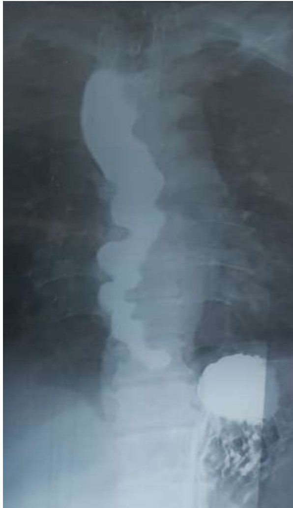
Fig 2: Barium swallow showing the corkscrew appearance