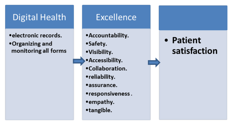
Figure 2 (Clarification Model of the Research)

excellence are embodied in saving wasted time which consequently leads to the exploitation of this time within the crowning glory of a greater range of every day statements; the ease of follow-up with patients via easy get the right of entry to their facts, and therefore elevating the exceptional of the fitness care carrier provided to sufferers.