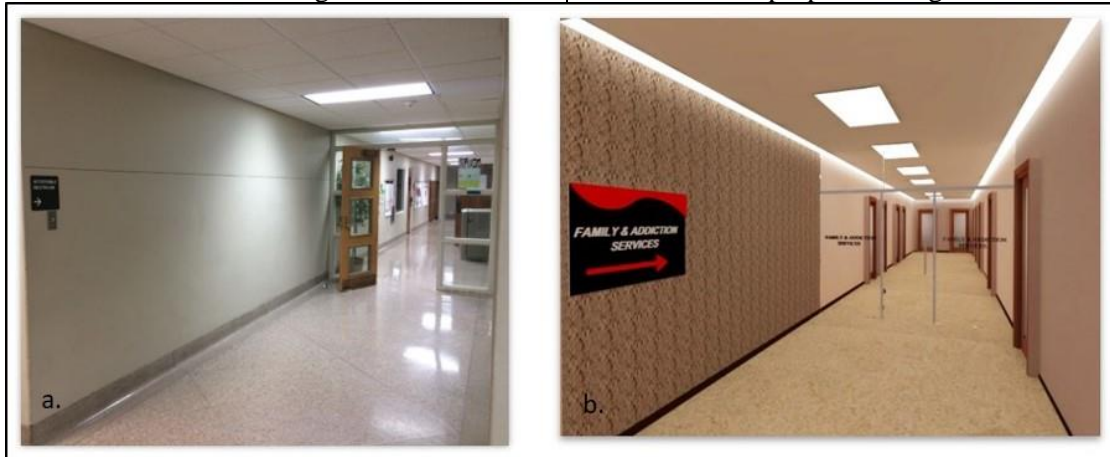
Figure 2: a). The current Family and Addisction Services department design. b). The proposed design of the department.

show the difference between the current place and the researcher proposed designs.