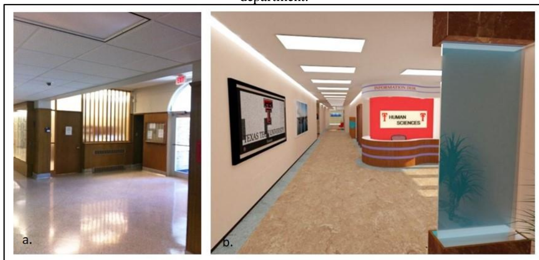
Figure 3: a) The current main entrance of the building. b) The proposed main entrance design.