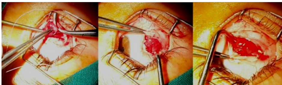
Figure (2): Anterior temporal transposition of IO in RT eye.