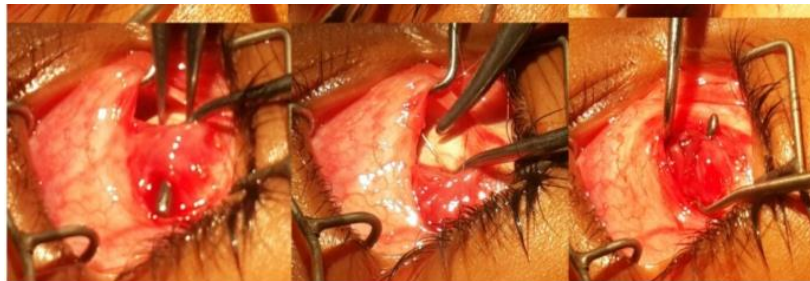
Figure (3): Nasal anteriorization of IO muscle in RT eye.

In group A preoperatively DVD angle in primary position was averaged 21.11 \pm 4.4 \Delta ( 10-25\Delta ), 26.35 \pm 4.3 \Delta ( 17-32 \Delta ) in adduction, and 5.5 \pm 2.02 \Delta ( 4-7 \Delta ) in abduction. After the operation, DVD was averaged 9.5 \pm 3.79 \Delta ( 5-15 \Delta ) in primary position ( P < 0.001 ), 4.8 \pm 1.94 \Delta ( 2-7\Delta ) in adduction ( P < 0.001 ), and 3.16 \pm 1.09 \Delta ( 0-5\Delta ) in abduction ( P > 0.05 ).