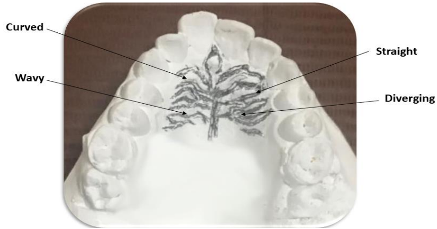
FIGURE (3): Pattern of palatal rugae as marked on maxillary cast.