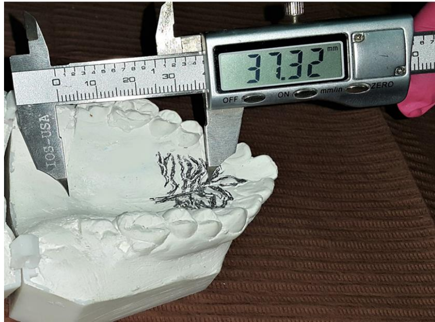
FIGURE (1): Measurement of palatal length (mm) by using a digital caliper.