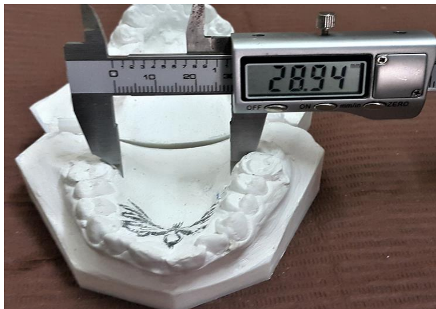
FIGURE (2): Measurement of palatal width (mm) by using a digital caliper.