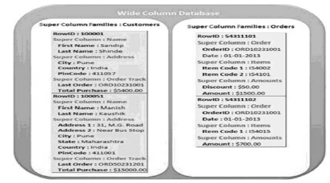
Fig. 4 Column store example

to optimize the data access is to structure the data in column families-groups of columns -as storage units. In 2008, Google released its column-based Bigtable DBMS. This remarkably influenced the development of the wide-column databases. The row key is an addressing of a database object in column-based stores within which there is another structure divides the row into multiple columns, all addressed by the same key. Timestamp versions are associated with the new entries in the table. Each storage unit is identified by a combination of column key, row key, and time stamp and is referred to as a cell. To control the access to the dataset, its column families are used for granting privileges of reading and writing to users and applications [10]. Column families are the only schemas that are defined when creating the table. The mechanism used to minimize the data retrieval time is by storing the data of the same type in one column family in one row of the dataset and reding it together [2]. Figure 4demonstrates how data is stored in the column family stores[13].