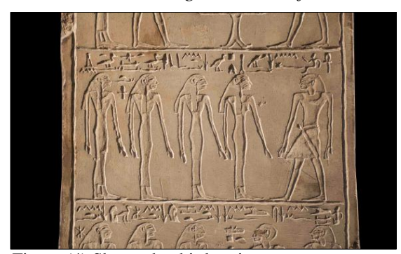
Figure (4) Shows the third register