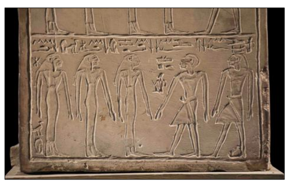
Figure (5) Shows the fourth register