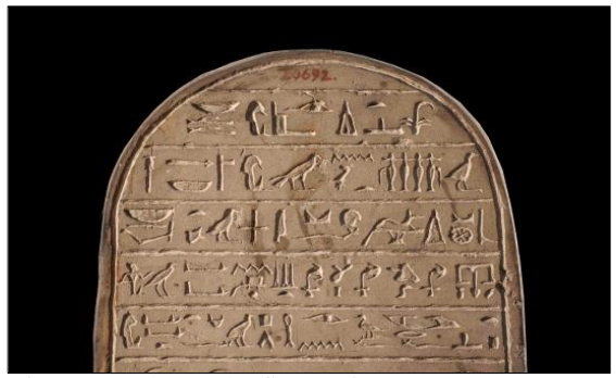
Figure (2) Shows the first register